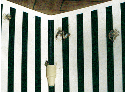
Figure 5. Indian meal moths captured at pheromone trap.

There are available traps for Indian meal moth that are baited with an attractant known as a sex pheromone. This is the chemical used by the female Indian meal moth to attract males. Such traps are very useful for identify “hot spots” of infestation. However their ability to control Indian meal moth is highly doubtful, despite occasional claims to this effect by suppliers. This is because the traps only capture males, and usually only a fraction of these. As mated females are not captured, they will continue reinfestation.