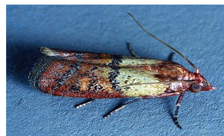
Figure 1. Adult Indian meal moth.

The Indian meal moth ( Plodia interpunctella ) is the most common household moth that can reproduce in Colorado homes. It develops as a pest of various foods commonly found in pantries. The caterpillars can seriously damage susceptible food items and the adult moths can become annoying as they fly through the home.