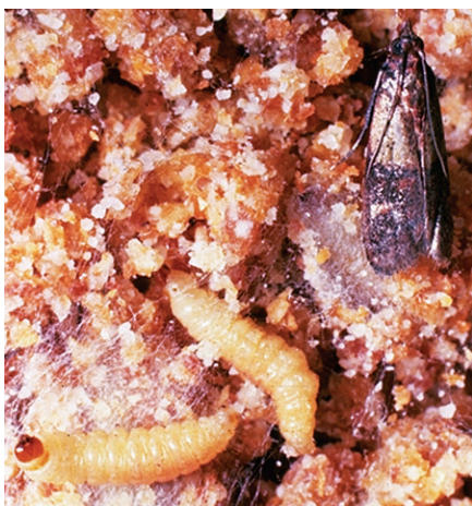
Figure 2: Indian meal moths cause problems on dried food products in the home. Adult and larvae shown.