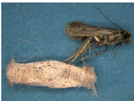
Figure 3. Indian meal moth larva.